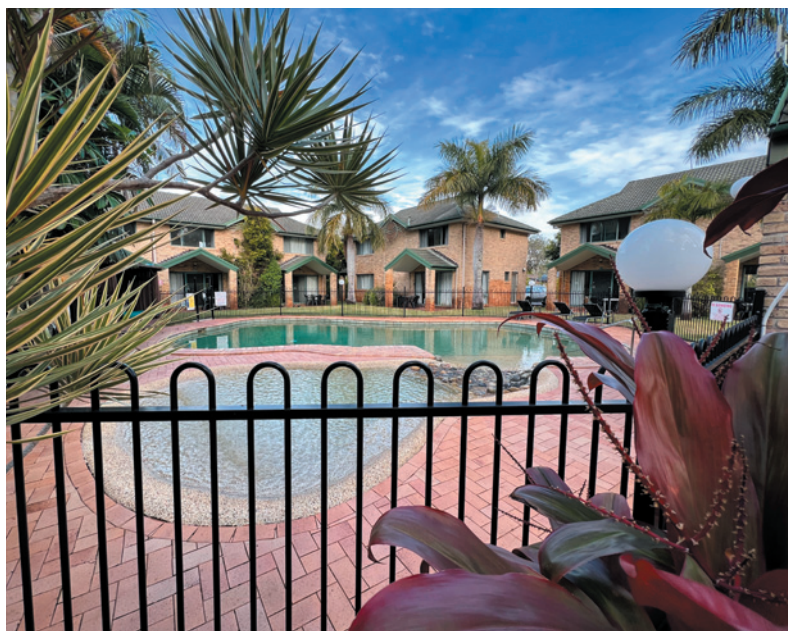
Comfortable townhouses surround the pool at Aqua Villa

The club house is on a rise, so the views are magical. The Lakes Restaurant is everything a good Golf Club restaurant should be. Great food and drinks selections at fair prices.