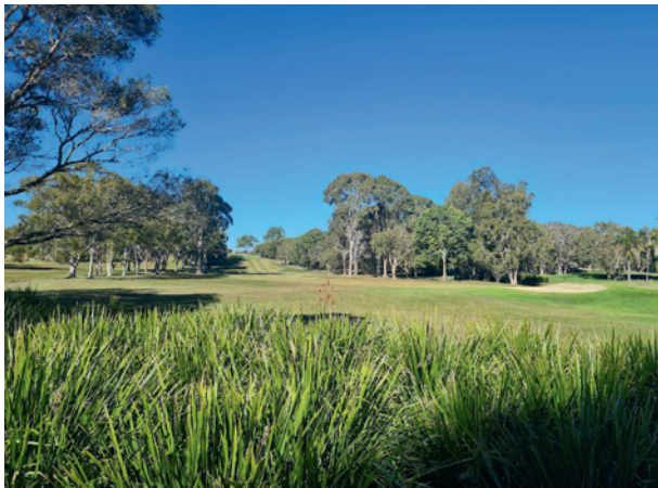
The course at Sawtell will leave you feeling refreshed.

The following day had us drive 11 km south to Sawtell. Sawtell Golf Club is an amazingly beautiful, 18-hole championship course. If you are a keen golfer, put this one on your bucket list. It caters for all abilities.