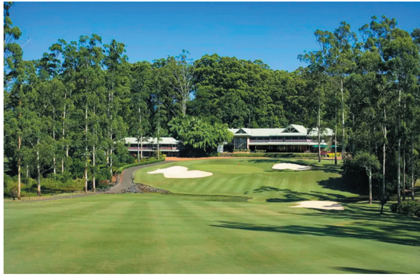
Bonville golf course has to be one of the most magnificent you will ever see.

The next day the ladies closely examined all the shops and cafes in Bellingen , which is a delightful country town just 30-35 minutes from Aqua Villa. Meanwhile John, Big Bertha and I swung our way around the Bellingen golf course while admiring the extensive views of the mountains, before meeting up with the ladies for a sumptuous snack at the Hyde Café in the township.