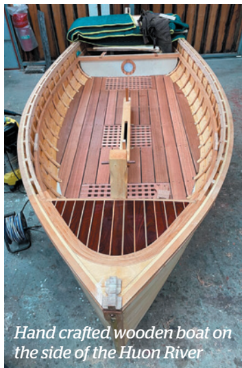
Hand crafted wooden boat on the side of the Huon River

An overseas holiday would not be the same without an adventure on the sea. Pennicott Wilderness Journeys has won multiple awards so you can be assured they are awesome. Take the Bruny Island Cruise for a fabulous day out. Make sure you book it through Experience Oz so you get your 10% API discount . The cruise sets off from Franklin Wharf, which is an easy walk from API's two-bedroom, delightful, sandstone unit in the historic suburb of Battery Point . You can select from a huge variety of tours and experiences, including the Port Arthur tour with the Carnarvon Bay Cruise and Isle of the Dead . Or perhaps kayaking around the harbour is more to your liking, or for an extra special occasion - a flight over Wineglass Bay . Whatever you do, first-of-all, login to the API website and then select Experience Oz . That way, all your bookings will be made with your API 10% discount .