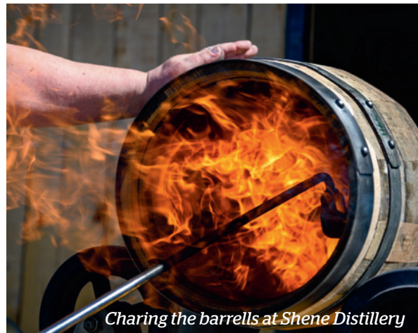
Charing the barrells at Shene Distillery

Shene Distillery is housed in beautiful heritage sandstone buildings. They describe themselves as being a whiskey village. Tours and tastings can be booked. Then have a chuckle at the evocative names of the bottles for sales 'Elixir of Life' or 'Mackey Enigma' or 'Poltergeist Gin'.