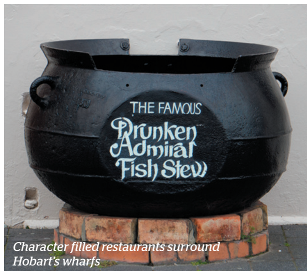
Character filled restaurants surround Hobart's wharfs

consuming the freshly prepared foods and local beverages. There is no shortage of opportunity, so do some walking first to build up an appetite and/or a thirst. Be warned, on Saturday, when the famous Salamanca Markets are in full swing, the food options expand even further. API