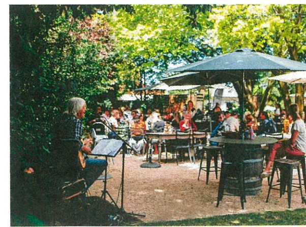
Sample the menu in the Clarendon Arms Beer Garden