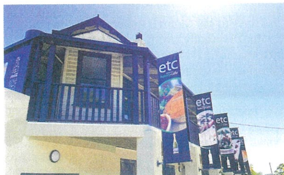
An unusual name for an unusually good café