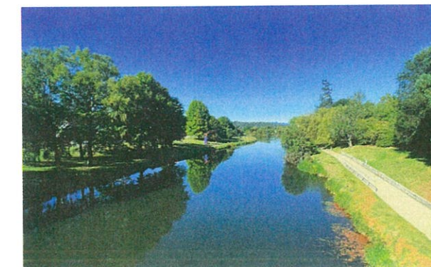
Take a stroll in Deloraine

Great produce attracts talented artisans, so it is not surprising that right next door you will find Christmas Hills Raspberry Farm . I am helpless when it comes to raspberries. I love them. The prices are so amazing that I am in heaven. The chocolate coated raspberries are my daughter's favourite. The café is exceptional and the tranquillity together with the views over the lake make it a perfect destination for lunch. The menu is extensive and there are so many desserts to choose from that deciding which one to have may be quite difficult. Before I discovered this gem, I did not realise how many desserts could incorporate raspberries.