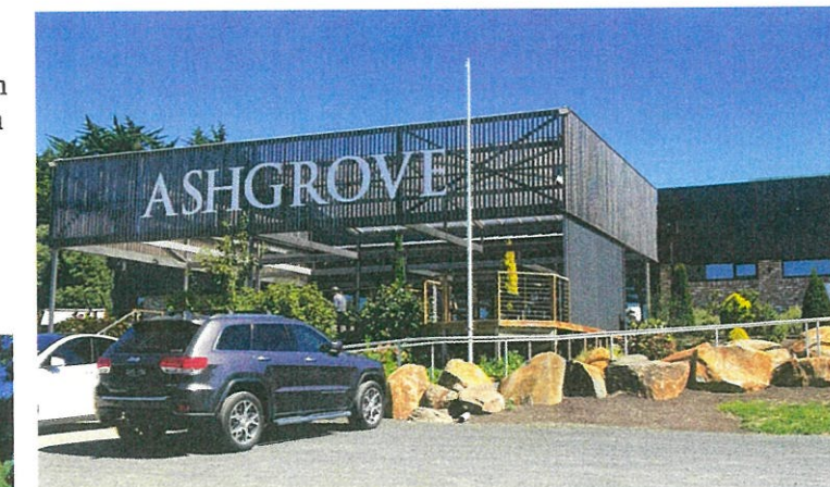
Don't miss the Ashgrove Dairy

You may recall in a previous article I mentioned the cool glow worm caves in Mole Creek . The good news is that they are not far away. You can break up your festival of all things edible with a walk through the caves - highly recommended. Not only do you get to participate in a very unusual opportunity to be able to boast about seeing glow worms, but the experience gives your appetite time to recover for the next round of food sensations. Your hardest decision is in which order to try them all without having to go back to the same one twice - or perhaps that is part of your cunning plan - is there any time of day when an extra ice cream is not allowable!