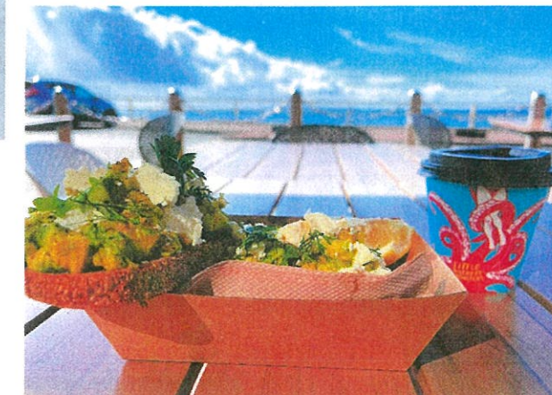
Smashed Avo @ Wingman Café on Main Beach

Beach Bums on Main Beach has been serving sumptuous brekkies for years so it can be hard to get a seat. A little further down the street, Wingman Espresso whips up a delicious smashed Avo and much more with similar views.