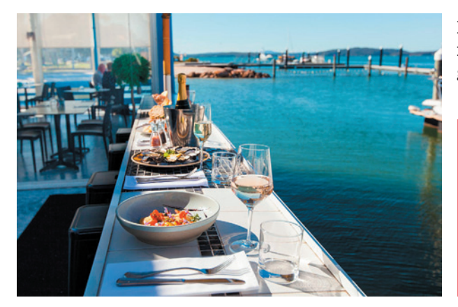
A quality experience at The Poyer's

I recommend arriving mid-morning. Either take your own picnic lunch, as there are beautiful spots to stop and enjoy the vistas or drive on a little further to the adjoining town, Lemon Tree Passage . Follow the road right to the end and you will arrive at The Poyer's restaurant at the marina. What a delightful place, standing right over the water. Oh, and the food is quite something, as is the presentation. Just be aware it is closed on Mondays and Tuesdays and the prices are reflective of the quality, presentation, and location. There are other alternatives close by to suit every budget.