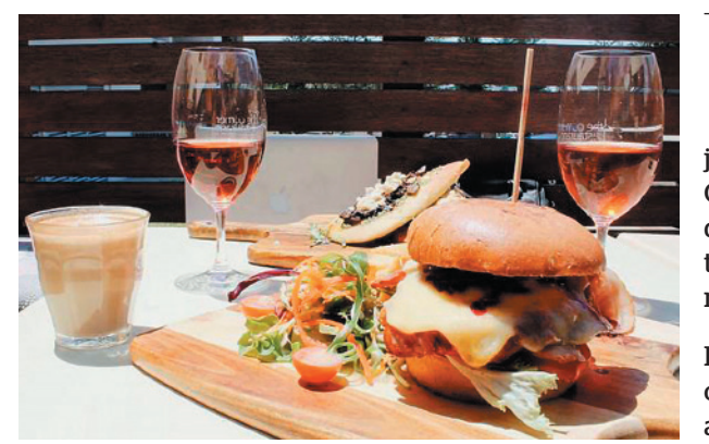
Campos Coffee and scrumptious food at the Corner Restaurant

I (Glenn), start every day with a Campos Coffee. It's a ritual. It gets the blood in my veins flowing. The Corner Restaurant supplies my heart-starter, and I love it. The Corner Restaurant at 11 Clarence Street, is one of the best breakfast joints and the menu changes with the seasons. Your holiday memories will be all the better for at least one meal there.