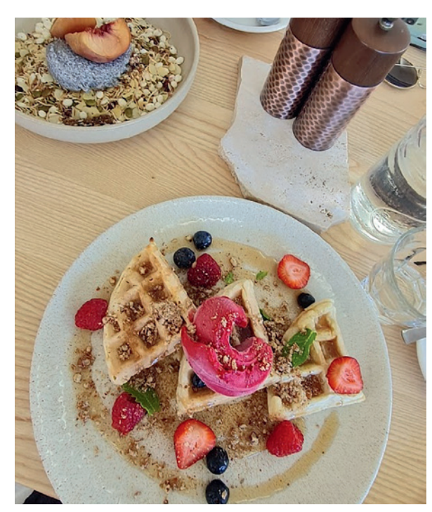
Fabulous food at Frankies Café & Catering

Do you subscribe to the adage that 'we eat with our eyes first'? For me, food tastes so much better if it looks appealing.