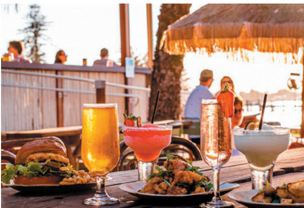
Waterfront position is ideal for the Little Shack

Port Macquarie is a thriving community. The town centre nucleus is just a block away. The river cruises are very popular, as is whale watching in the season. The beaches are fresh and clean and range from sheltered bays to surfing spots. The Coastal Walk is