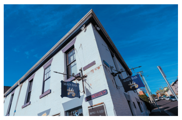
The cosy Shipwright Arms has hearty meals close to your accommodation

API's Battery Point two-bedroom apartment is receiving so many great reviews. Its location is so fantastic that you don't need to hire a car during the days you allocate to exploring Hobart. Being so close to Salamanca Markets and Constitution Dock, you could reach many other destinations by boat, putting that car hire money into a cruise instead. For example, cruises can take you to MONA (you should not miss MONA whatever you do), Port Arthur, Bruny Island, as well as wildlife sight-seeing. It gets better. As an API member, you can get 10% discount on the cruises through Experience Oz or RedBalloon , so seriously, ask yourself how long you need to hire a car for. Then head to the API website and get a discount on the car hire as well. My strong recommendation is book your car hire well in advance as there is a shortage of hire cars in Tasmania currently.