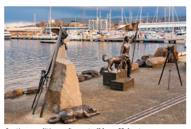
Arctic expeditions often set off from Hobart

The name 'Battery Point' refers to the canons placed in this suburb to repel possible attacks from the French and other nations who wanted to get their hands on the whaling industry. Today, we have great reverence for the graceful whales passing our coastline. Today, we get lubricating oil from petroleum industries and our lights run on electricity. Hobart was founded as a whaling station, when all oils for lamps and everything else could only be derived from whales, and that history is abundant around Constitution Dock. Keep a sharp eye to find places you could tie up your horse, while you drop into an inn!