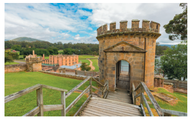
Port Arthur can be a short cruise destination from Hobart

Issue 2 • Apr - May 2023 • Inspirations for better living