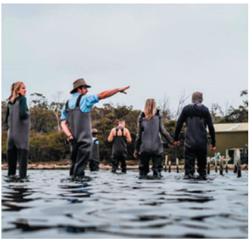
10. Take a tour of the Freycinet Marine Farm or Melshell Oyster Shack. Alternatively, tuck into some of the freshest seafood - with wine of course. The oysters are harvested daily.

is accessible via a section of unsealed road. You will delight in the small heritage town surrounded by inspiring