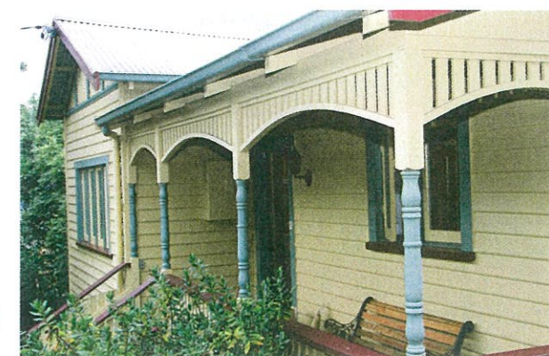
Sleep in 120 year old API home

“ This hub encourages wider exploration opportunities. ”