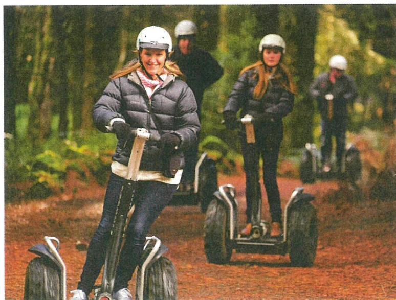
Segway to HollyBank

If you would like a very different way to experience the Tasmanian forests, head up to Underwood for the Hollybank Wilderness Adventures . The Segway tour will take you roaming through the forest for 90 minutes - with remarkably few steps! The zip line and tree-top walk are a magnet for those who are more energetic.