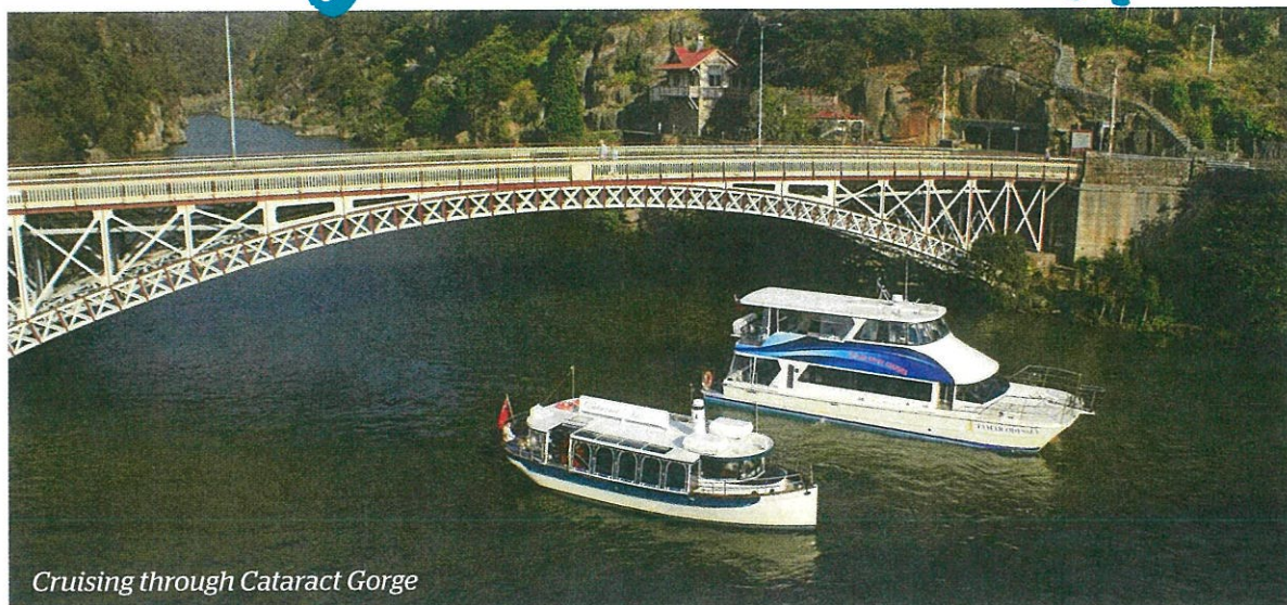
Cruising through Cataract Gorge

Watching the impressive, verdant, scenery glide past, while cruising the Tamar River is listed in Wikipedia under the definition of 'relaxation' - well if it is not, perhaps it should be! The biggest question I was facing was whether I could fit in another surprisingly delicious focaccia roll. The wine and beer tasting on the cruise was lip-smacking fun, but I was beginning to regret having eaten too many of the muffins at the morning tea, just a little earlier. The 4-hour trip was a highlight for me and has been for many other members. The commentary was humorous and informative, and the crew were welcoming. While there is a shorter cruise, I recommend putting aside the time for a rewarding lunch or evening cruise - and checking out the discount API members get through the API website and Experience Oz or Redballoon .