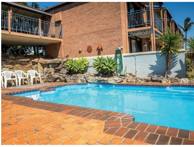
The pool is relaxation area

Location wise, we are closer to Town Beach itself, approximately 400 metres away - which will be welcomed by sun worshipers and castle builders alike. We are also closer to the ever-popular Bowling Club, which might be dangerous for our waste lines as the meals they serve are a big attraction.