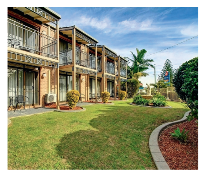
Town Beach Motel and Apartments set in manicured gardens

We will also have a room designed for people with mobility issues. It is designed to accommodate wheelchairs in the bathroom etc so there is no excuse not to come to Port Macquarie for a holiday.