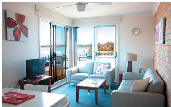
Beautiful water views from the lounge and balcony.

Nestled in the heart of Tuncurry, these units provide a peaceful and serene retreat, just a stone's throw away from the stunning beaches and vibrant attractions of Forster. Imagine waking up each morning and stepping onto your balcony, sipping your morning coffee while soaking in panoramic views of the clear water at the entrance to Wallis Lake. It's the ideal way to start your day, filling you with a sense of calm and tranquillity.