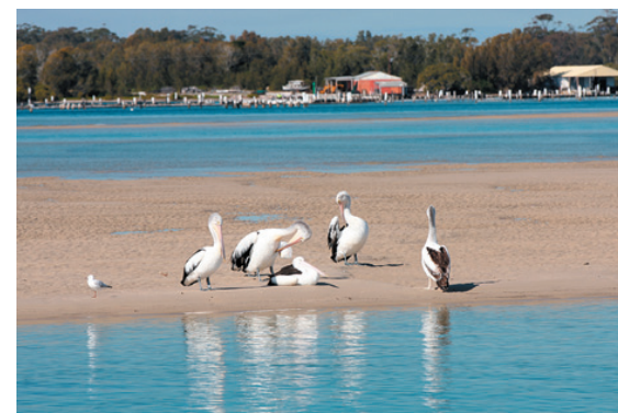
Tranquillity abounds in Forster-Tuncurry.

However, it is not just about beaches and marine life; this area offers a plethora of outdoor activities for every adventurer at heart. From kayaking through tranquil waterways to exploring nearby national parks through scenic bushwalks, there is no shortage of opportunities to connect with nature and immerse yourself in the natural beauty that surrounds you.