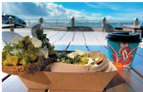
Smashed avo with feta on seeded toast at a beach front café - yum!

These units are well designed with modern amenities and a cozy ambiance that will make you feel right at home. From the comfortable living room, with those fabulous views, to the fully equipped kitchen, you'll have everything you need for a relaxing and enjoyable stay. Whether you're traveling solo, with a partner or even with your family of up to five people, Fairholme provides ample space to unwind and create lasting memories.