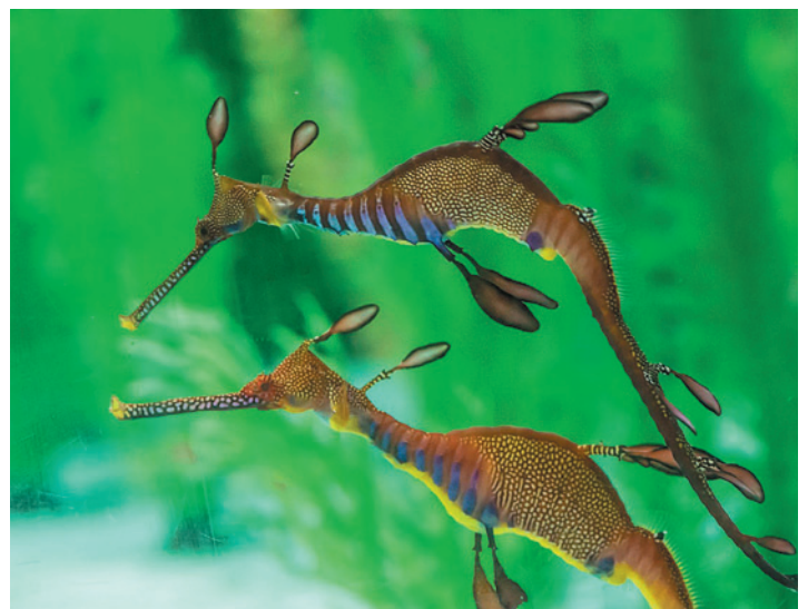
Sea Dragons at Beauty Point's Seahorse Farm.

45-minute guided tours are the way to go. You will learn the difference between a seahorse and a sea dragon amongst other gems of wisdom which come in handy on trivia nights. Most importantly, you will get to see these living pieces of jewellery gliding serenely around, with your own eyes. All age groups come away with smiles.