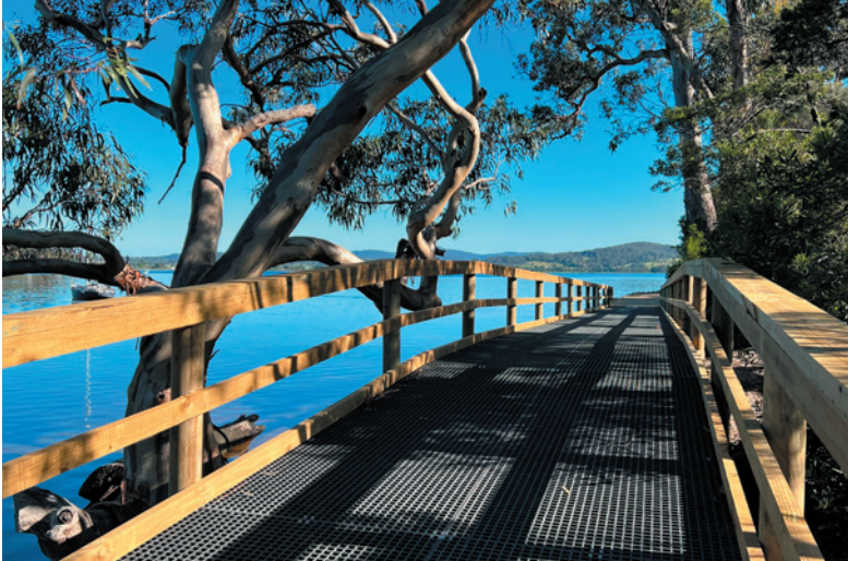
The coastal boardwalk will blow your mind!

As you explore the Bay of Fires, don't miss the opportunity to visit Binalong Bay, the southern gateway to this coastal paradise. The panoramic views from the Binalong Bay Lookout are simply awe-inspiring, providing a glimpse of the stunning natural beauty that lies ahead. Whether you choose to take a leisurely stroll along the beach or bask in the tranquillity of the surroundings, Binalong Bay offers a serene escape.