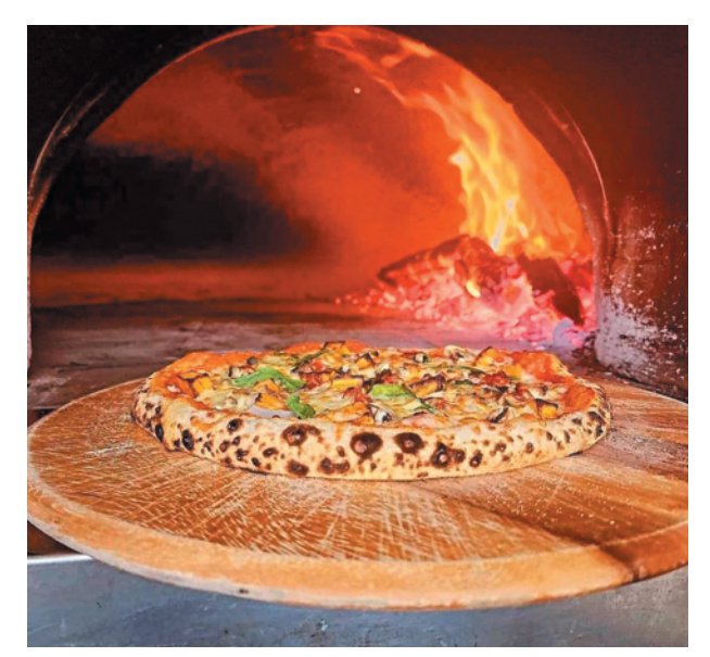
Delicious woodfired pizza at The Grapevine Eatery, 25 Quail Street.

As you drive through the picturesque landscapes, consider venturing into the heart of St Helens' hinterland, where you'll discover secluded spots and untouched wilderness. The region's diverse geography promises surprises around every corner, from dense forests to rolling hills and pristine rivers.