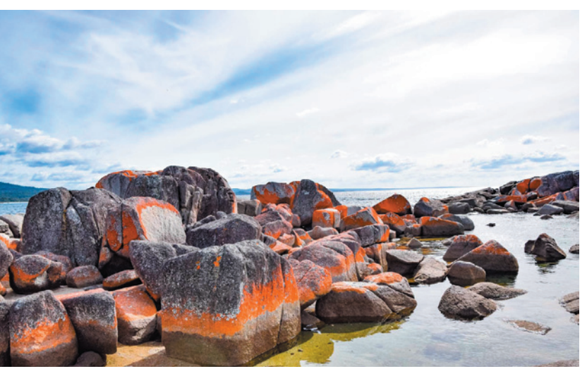
Bay of Fires colourful rocks and clear water

The crown jewel of St Helens' attractions is undoubtedly the renowned Bay of Fires , a stretch of coastline that has earned its reputation for having some of the world's whitest beaches, crystal-clear turquoise waters, and distinctive, orange-tinged granite rocks. The juxtaposition of the white sand against the fiery-hued rocks creates a mesmerizing contrast that has captivated visitors from around the globe.