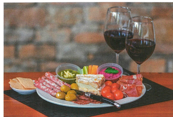
Charcuterie platters to die for - enjoy one on the deck

St Columba Falls Road takes you to a spectacular 90-metre waterfall and then further along, you will arrive at St Helens, where your three-bedroom holiday home, with extensive views over the bay, awaits you.