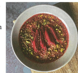
Breakfast of buckwheat & vanilla bean coconut porridge with rhubarb and pistachio at the Naturaliste

Call in to St Helens and pick from one of the many restaurants. The Naturaliste serves such a taste bomb of tacos with fried chicken, jalapenos and pickled red onion slaw. It was so good that we went back one morning for breakfast of buckwheat and vanilla bean coconut porridge with rhubarb and pistachio - who thinks up these delicious combinations? St Helens is a foodie's paradise, so indulge yourself. You only live once.